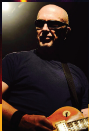
Ronnie Peterson Guitar