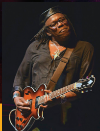
Joe Louis Walker Vocals